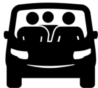
Sharing / Rental