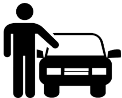
Residential / Consumer Market