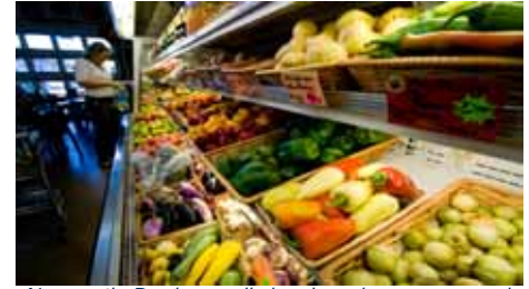
Newcastle Produce sells local produce year round

SACOG has been developing crop data and compiling other information resources to help farmers, local officials, and community members have more information about their agricultural and rural lands. The information on this page comes from the 2008 Placer County Agricultural Crop Report.