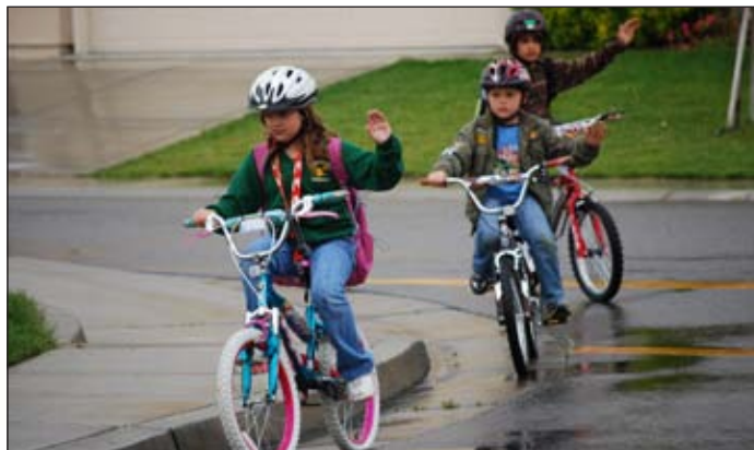
Top left: May is Bike Month featured a fair at the State Capitol building with information on a variety of bicycling topics. Top right: One cyclist arrives at the fair wearing the "I Ride" t-shirt. Bottom: students from 85 area schools participated in May is Bike Month this year. Student activities included bicycle safety classes.