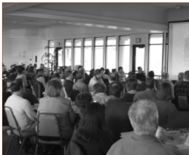
Participants at Sacramento County Workshop