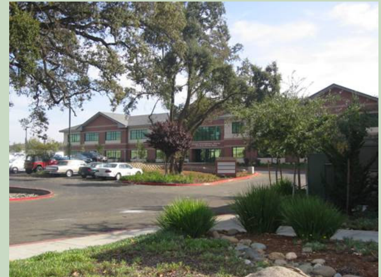
New Folsom Professional Center--- adjacent to intersection of Humbug- Willow Creek Trail and Folsom Rail Trail