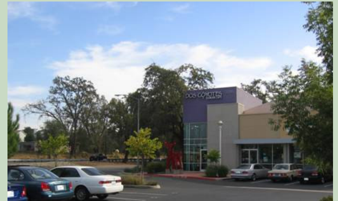
One of several restaurants that back up to the Humbug-Willow Creek Trail