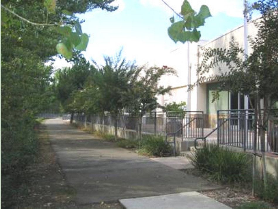
Access to retail center from existing Humbug-Willow Creek Trail