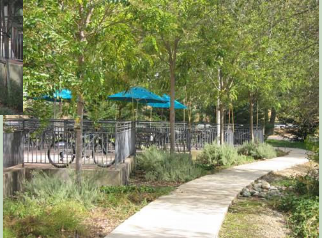
Outside dining at Dos Coyotes that backs up to the Humbug-Willow Creek Trail