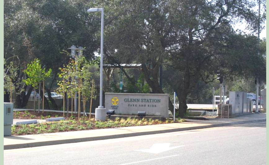
New light rail station (Park & Ride Lot) at Glenn Drive and Folsom Boulevard