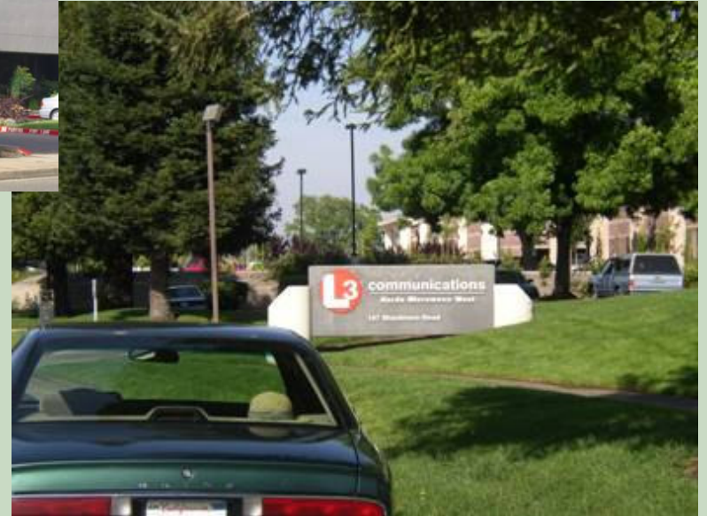
Some of the business in Lake Forest Technical Center