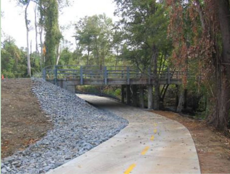
Brand new bike/pedestrian Undercrossing at Blue Ravine Road Proposed gap closure project would connect to this new undercrossing.