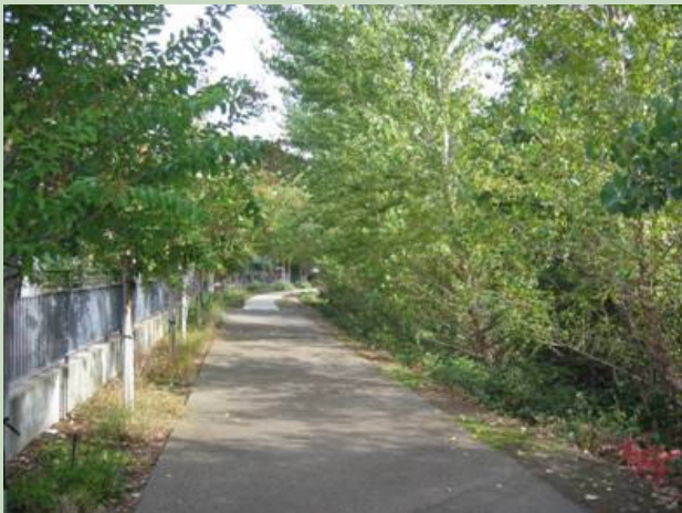
End of existing HBWC Trail, start of proposed gap closure project, that will extend to the Lake Natoma Trail Retail and two restaurants are located to the left of the trail.