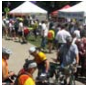
Over 1.24 million bicycle miles were logged in May.

SACOG unveils tools for civic engagement to support cities, counties, transit agencies and air districts to elevate the public education and involvement in infill and smart growth community development. Tools include technical support, direct grants, visual simulation (3-D) planning, photo simulations, educational materials, videos and presentations, and a planning and transportation improvement photo database.