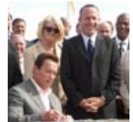
Governor Schwarzenegger and Senator Steinberg at the signing of SB375.

SACOG received the Government Finance Officers Association Certificate of Achievement in Financial Reporting for the fiscal year 2006-07 financial statements. This is the second year SACOG's financial team has been recognized with this award.