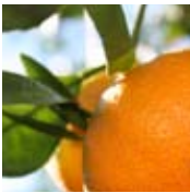
Mandarins were one of the highlights of the Placer County Agricultural Tour.

Association of Metropolitan Planning Organizations recognizes SACOG with Honorable Mention Award for Excellence in Metropolitan Transportation Planning for the MTP2035.