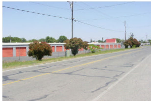
11 - Storage rental facility