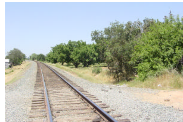
15 - Looking Northwest along railroad formina Southwestern border of studv area