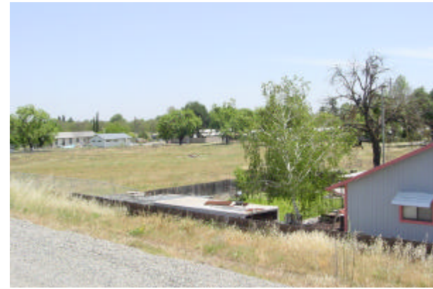
2 - Single family residence, adjacent to vacant land