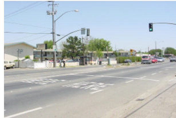
8 - Multi family homes, looking North from Beale