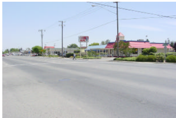
10 - Commercial strip, looking Southeast along Beale North of Park