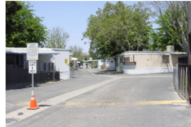
9 - Mobile home & RV park, behind (North of) multi-family homes