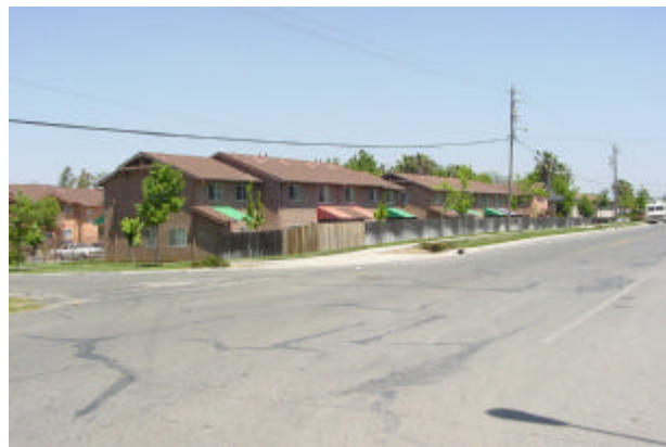
12 - Multi-family homes, looking North from Hammon-ton-Smartville