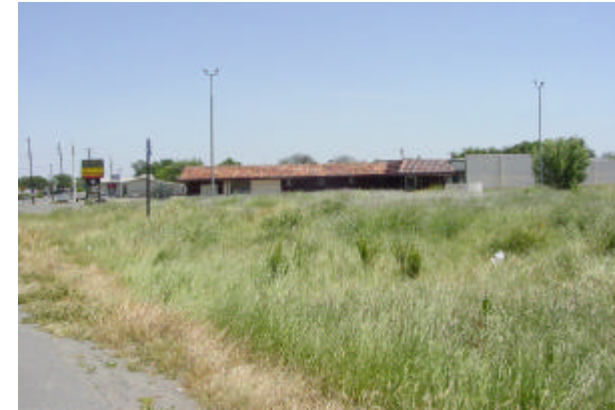
6 - Looking Southeast from Beale at restaurant & adjacent vacant land