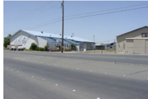
5 - Vacant building supply store, looking Northwest from Beale