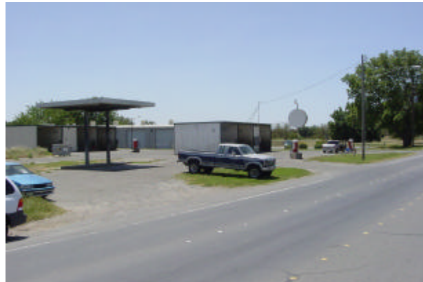
7 - Vacant gas station