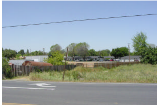
4 - Looking Northwest at area of single family homes and adjacent vacant land