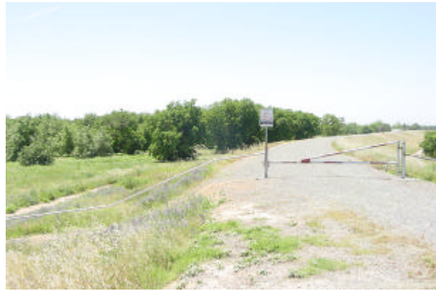
1 - Levee road leading south adjacent to agricultural land