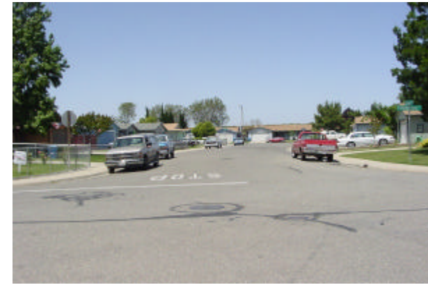
3 - Single family homes