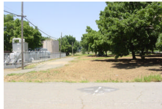
13 - Water Diistrict facility adjacent to orchards