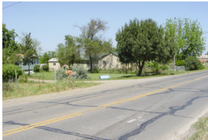
4 - Single family residences, with adjacent vacant land