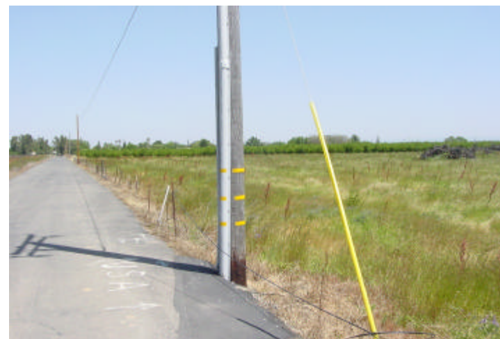
8 - Agricultural land, adjacent to water treatment facility, looking East