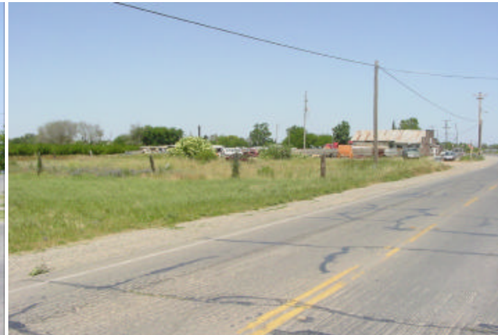
3 - Automobile yard, looking West from Feather River Blvd