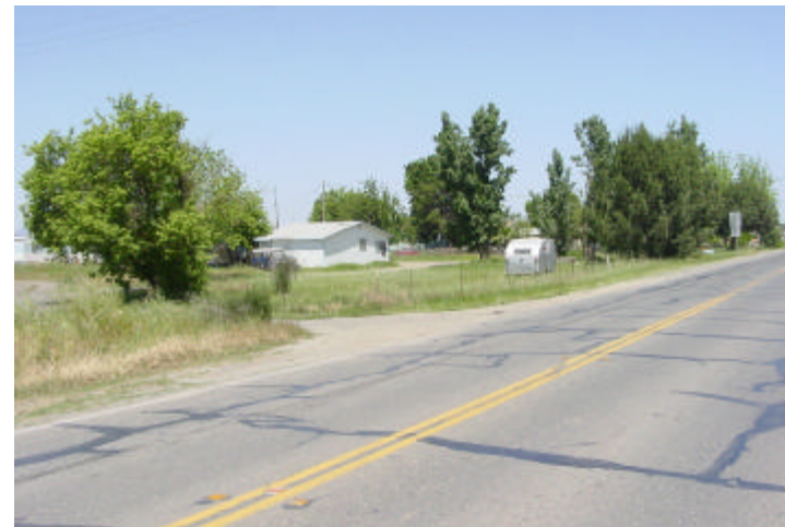
5 - Large-lot single family home