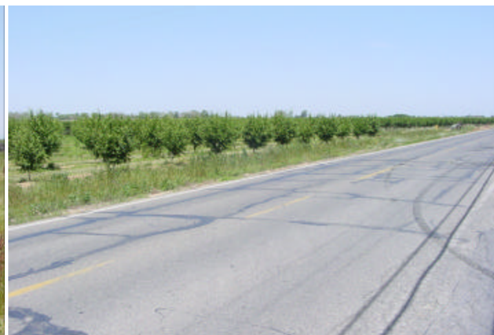
9 - Orchards, looking Northwest from Feather River & Curtis