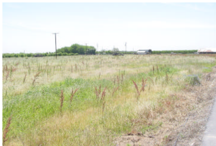
7 - Agricultural land, adjacent to water treatment facility, looking West