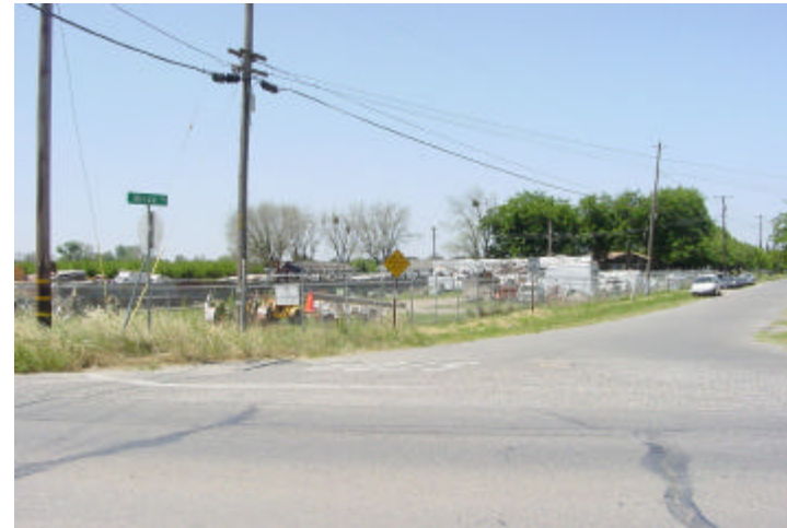
2 - Equipment yard, on Southwest corner of Myrna & Feather River Blvd