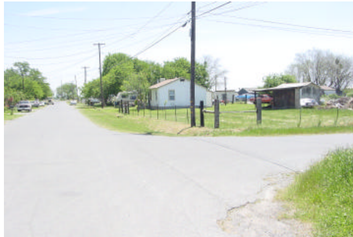
1 - Single family residential, Looking Southwest from Myrna