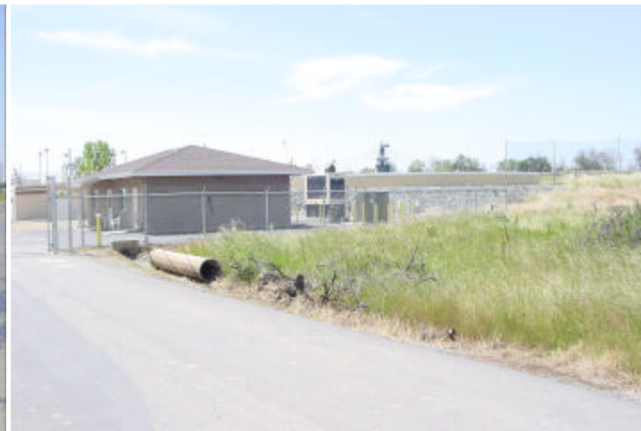
6 - Waste water treatment facility