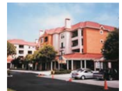
16 Mixed-Use Residential Focus High-Rise