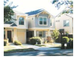
4 Small Lot Single Family Residential