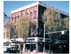
20 Mixed-Use Retail/Office Mid-Rise