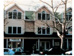
16 Mixed-Use Residential Focus Mid-Rise