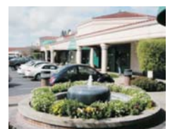
12 Community/Neighborhood Retail