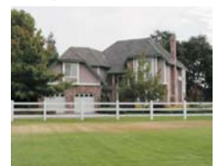
1 Rural Residential