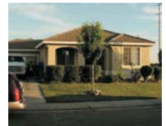
2 Large Lot Single Family Residential