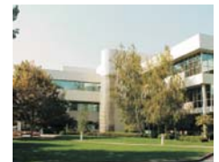
10 Mid-Rise Office