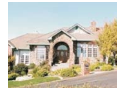
2 Large Lot Single Family Residential