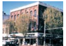
20 Mixed-Use Retail / Office Mid-Rise