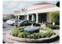
12 Community / Neighborhood Retail