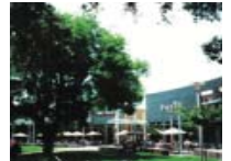
14 Mixed-Use Retail / Residential Horizontal