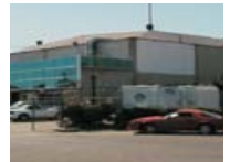
22 Light Industrial