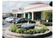
12 Community / Neighborhood Retail