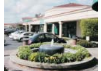
12 Community / Neighborhood Retail