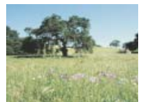
25 Open Space