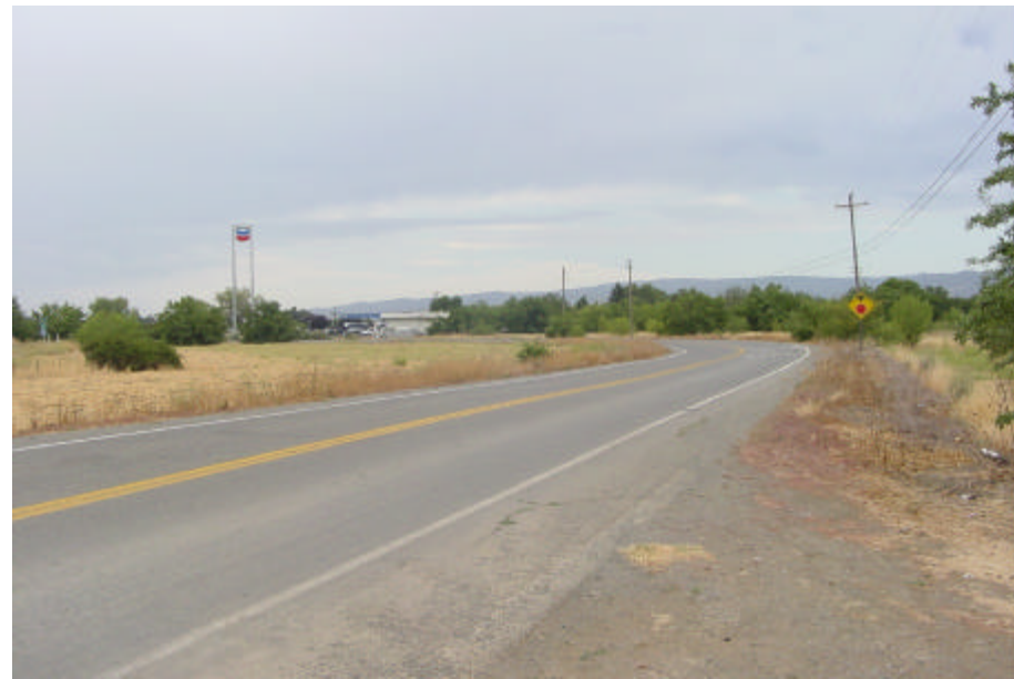
2 - Looking Southwest on County Road 90A, toward Highway 128 (Grant Av)