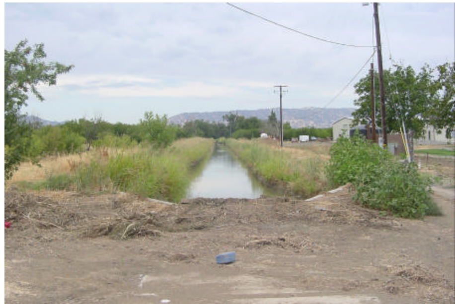
1 - Willow Canal, as seen from County Road 90A