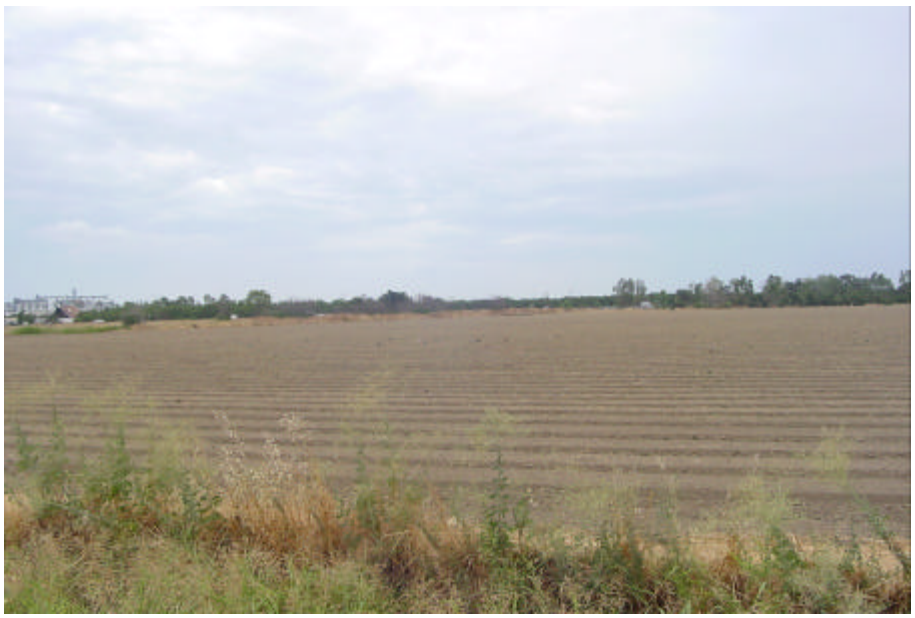
3 - Agricultural land looking South from Highway 128