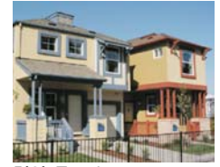
5(O) Townhouse (Owner)