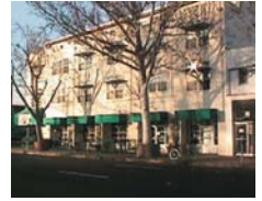
18 Mixed-Use Employment Focus Mid-Rise