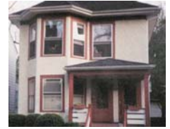
4 Small Lot Single Family Residential