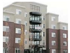
8(R) High-Rise Apartments (Rental)