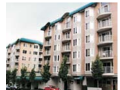
8 High-Rise Condos