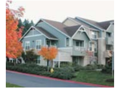
7 Mid-Rise Condos