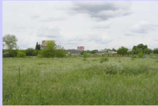
Vacant lot on US 99 North of Bogue