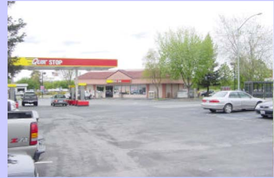
Convenience store on Northeast corner of US 99 and Bogue