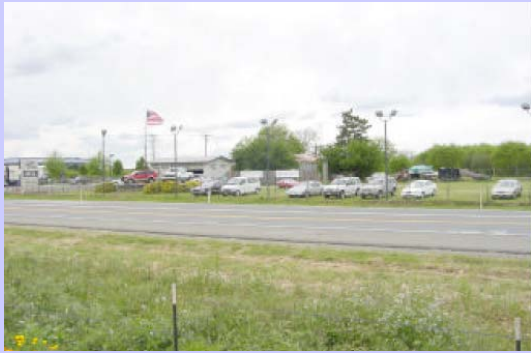
Auto sales lot on Northwest corner of US 99 and Bogue