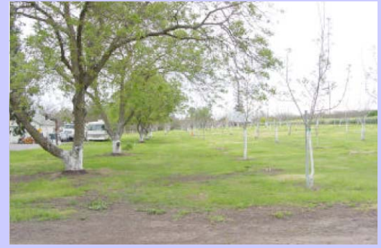
Orchard, looking South from Smith