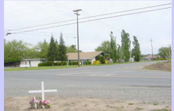
Church and preschool on Northeast corner of Walton and Bogue