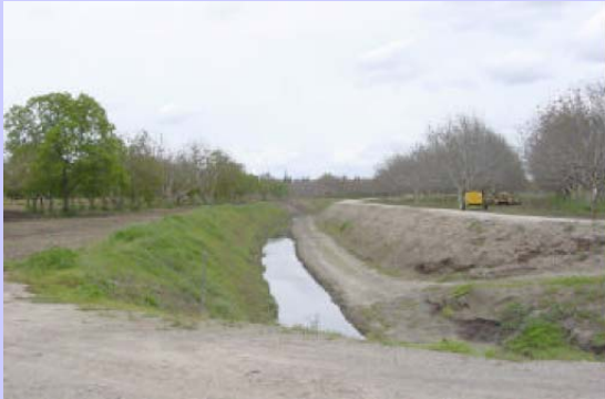
Looking North from Smith