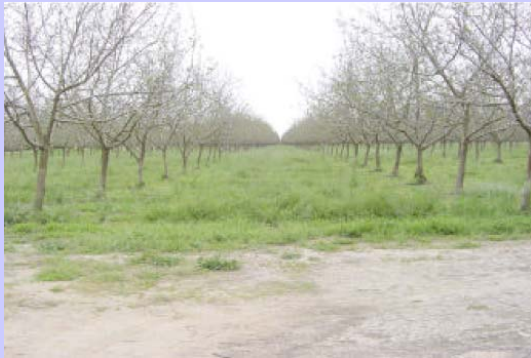
Orchard land, looking South from Lincoln, West of US 99