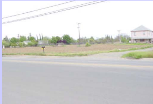
Home surrounded by orchards, on Walton at Augusta