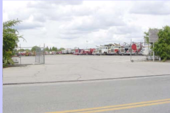
Commercial truck lot on Northeast corner of Smith and US 99