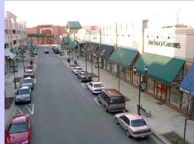
“Big Box” Main Street