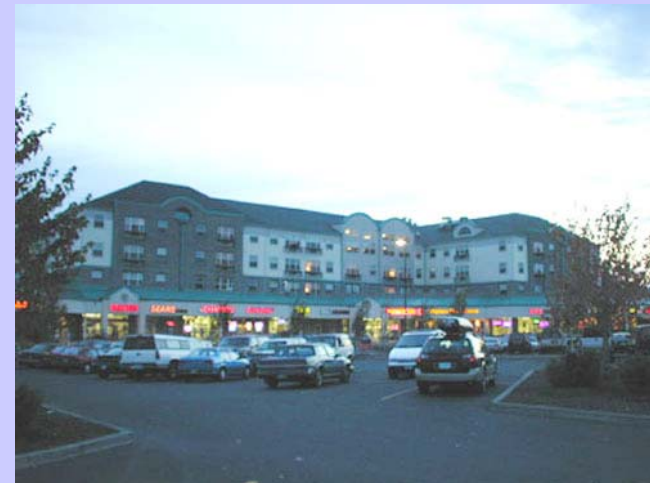
Sr. Housing over Retail