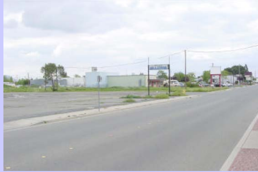
Auto sales and vacant land, looking Northwest from frontage road