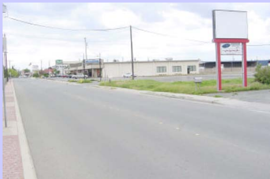
Retail and vacant land, looking Southwest on frontage road