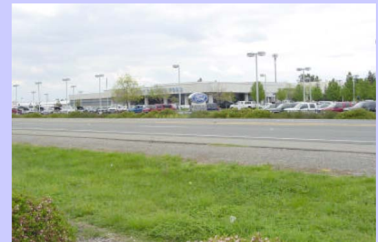
Large auto dealership on East side of US 99