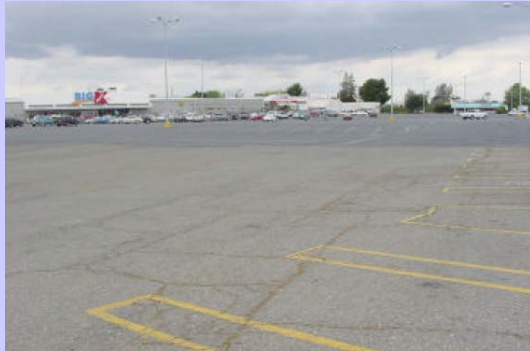
Retail center with large anchor