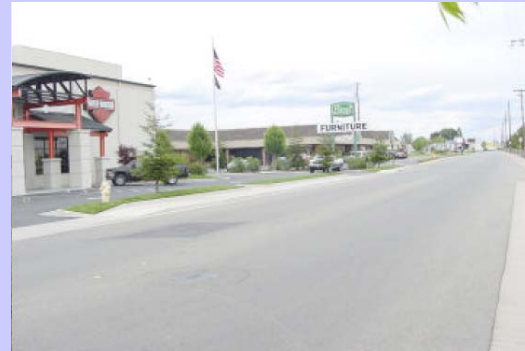
Looking Northwest from frontage road at retail shops and center