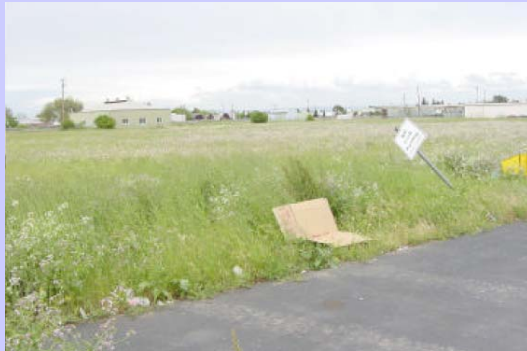
Vacant land, bordered by storage facilities and retail outlets