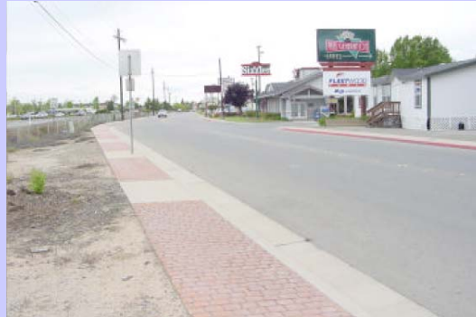
Mobile home sales, looking Southwest on Onstott Frontage Road