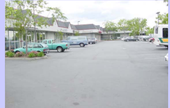
Retail center behind mobile home sales, includes bowling alley