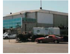
22 Light Industrial