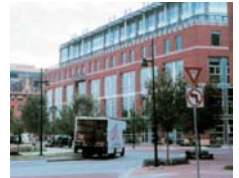
24 Public/Civil/ Education