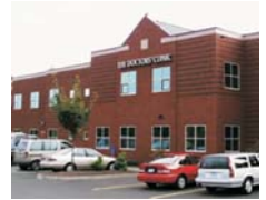
10 Mid-Rise Office