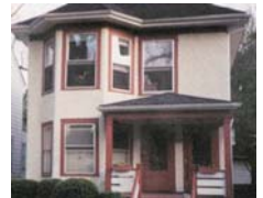
4 Small Lot Single Family Residential