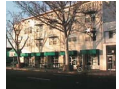
18 Mixed-Use Employment Focus Mid-Rise