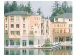
19 Mixed-Use Employment Focus High-Rise