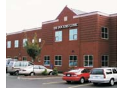
10 Mid-Rise Office