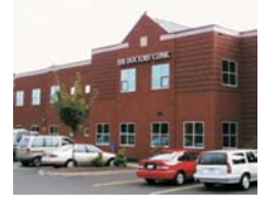
10 Mid-Rise Office