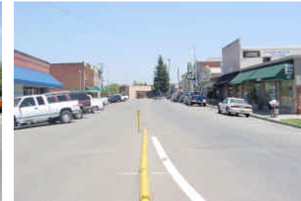
8 - Commercial uses looking Northeast on Church Street