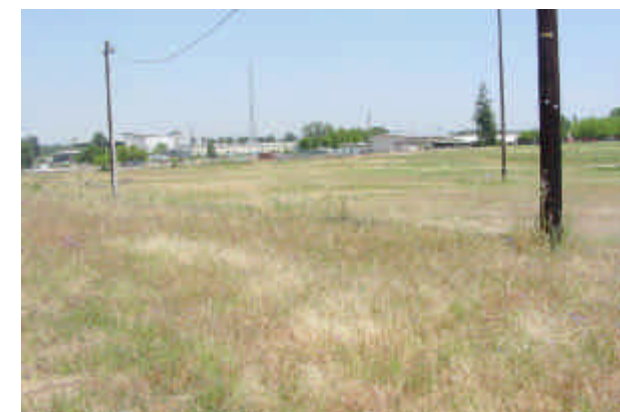
14 - Open field at the Roseville Fairgrounds