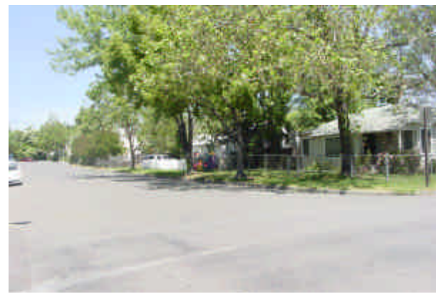
1 - Single Family Residential at the intersection of Grant and High Street