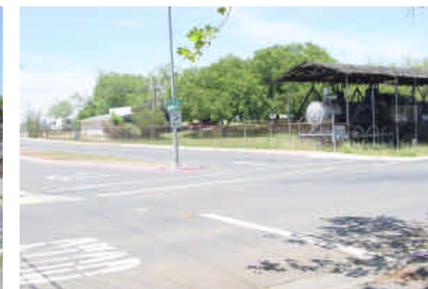
13 - Historic attraction at the intersection of Los Vegas and Lawton Ave