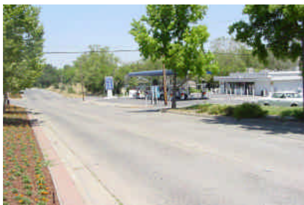
10 - Gas Station looking North on Washington Boulevard