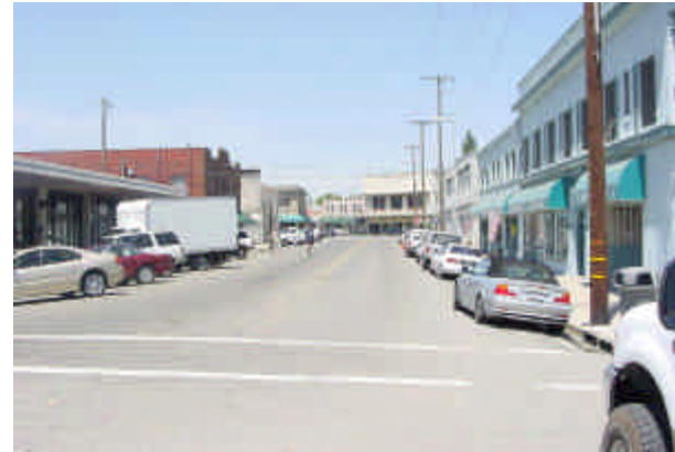
4 - Commercial uses, looking Northwest on Lincoln Street