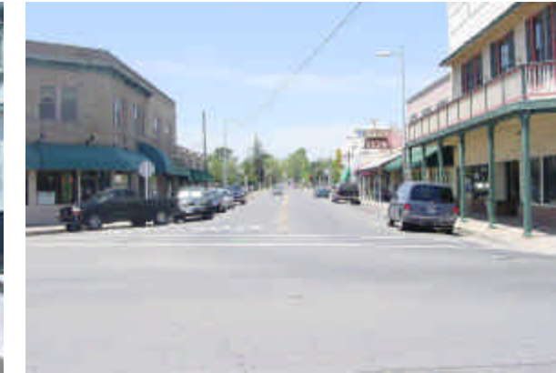
5 - Main Street in Oldtown Roseville