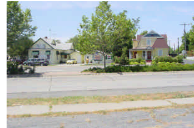
9 - Mixed use Commercial/Residential on Washington Blvd