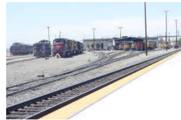
3 - Roseville train yard