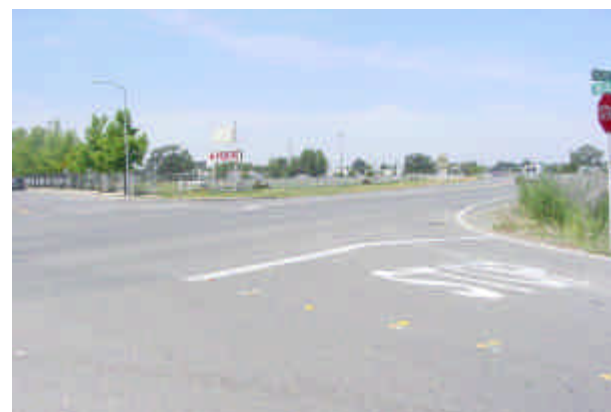
11 - Entrance to Roseville Fairgrounds