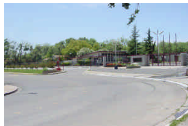
12 - Elementary School at the intersection of All American Cities Blvd and Los Vegas Ave