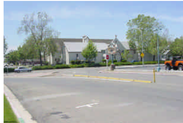
7 - Church at the intersections of Church and Washington Blvd