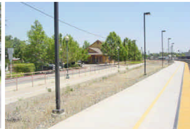
2 - Entrance to the Roseville Amtrak Station