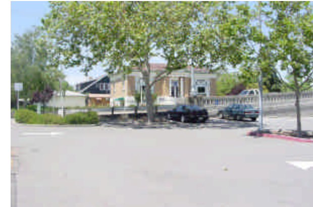
6 - Railroad Museum at the intersections of Lincoln and Pleasant Street