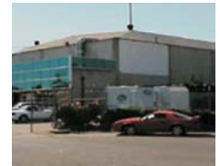
22 Light Industrial