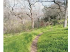
25 Open Space