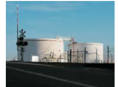
23 Heavy Industrial