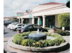
12 Community/Neighborhood Retail