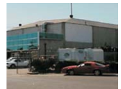
22 Light Industrial