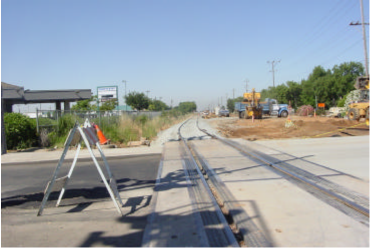
1 - Rail improvements for future extension of light rail lines running through Northwestern boundary of study area