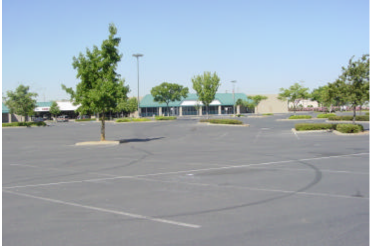
2 - Retail center with vacant anchor stores