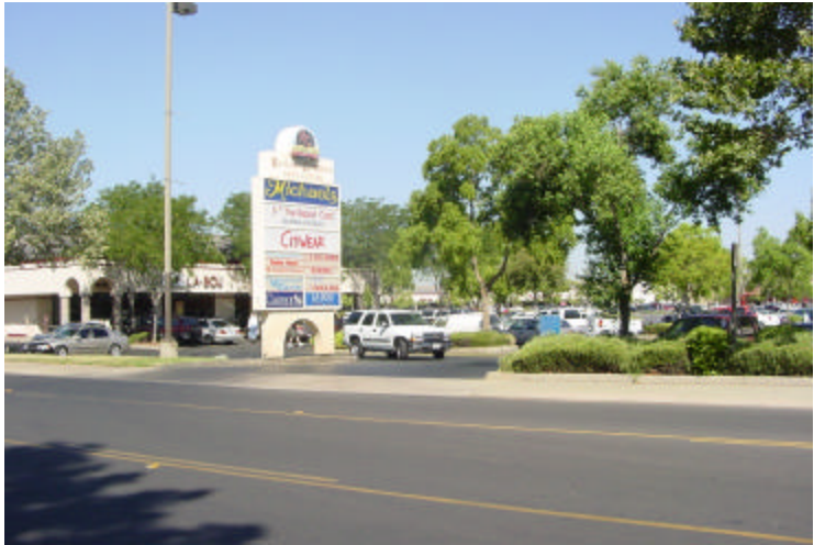
4 - Retail center across Olson from retail & mid-rise offices