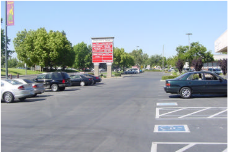
3 - Retail center bordering Olson Drive