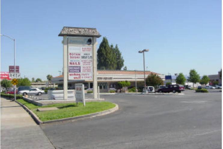
6 - Looking North along Zinfandel toward restaurant & retail space