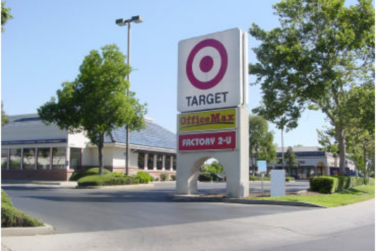
5 - Retail center across Olson from hotel & retail