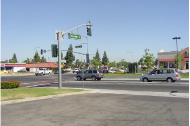
7 - Looking Northeast across intersection of Olson & Zinfandel toward retail centers & restaurants