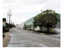
22 Light Industrial