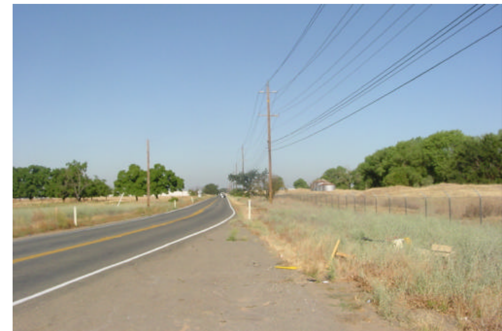
4 - Vacant land, looking West along White Rock Road, Southern boundary of study area