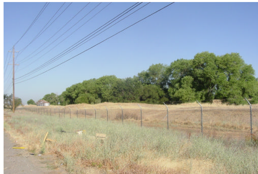
3 - Silos & trees among dredge tailings, looking Northwest from White Rock Road