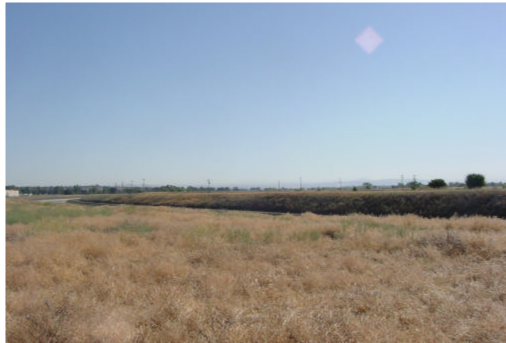
1 - Looking East across study area, from back of businesses on Mercantile Drive (canal in foreground)