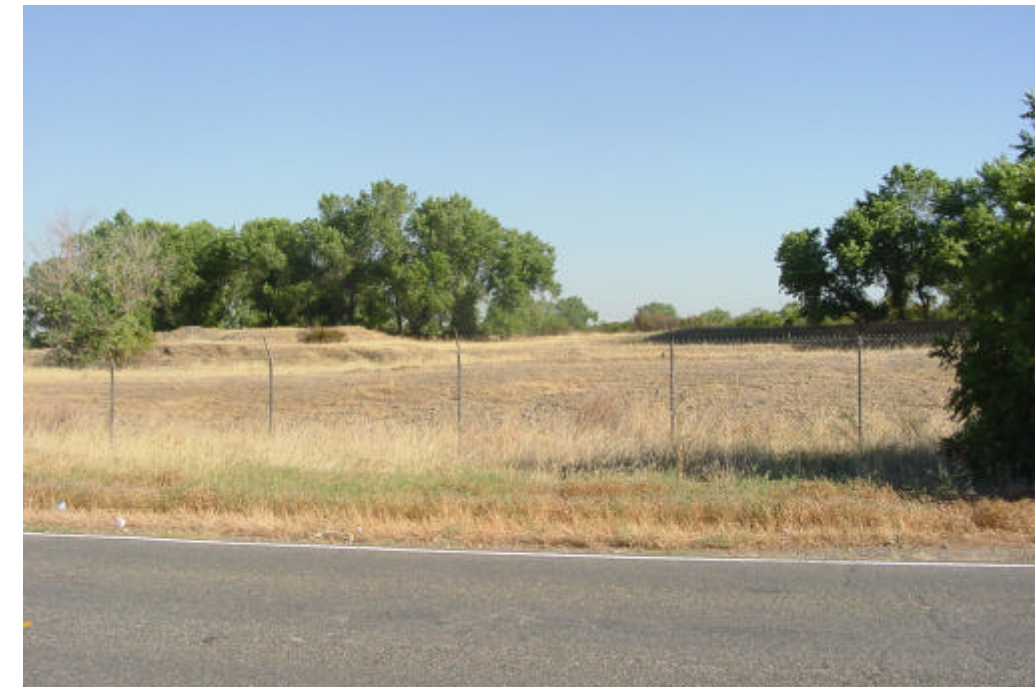
2 - Dredge tailings and trees on vacant land North of White Rock Road