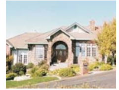
2 Large Lot Single Family Residential