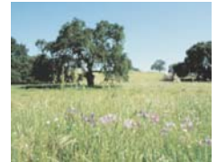
25 Open Space