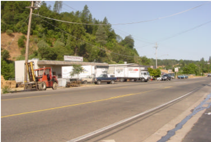
6 - Food distribution warehouse, adjacent to commercial