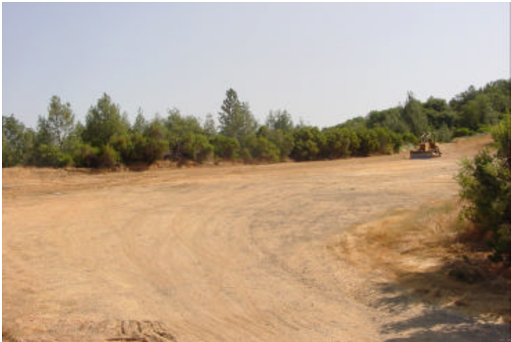
8 - Unpaved road leading into open wooded land