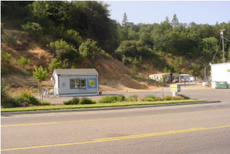
3 - Drive-thru coffee shop, adjacent to industrial land & parking lot