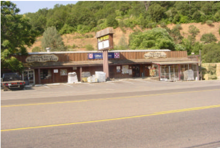
7 - Feed supply store & adjacent clothing store