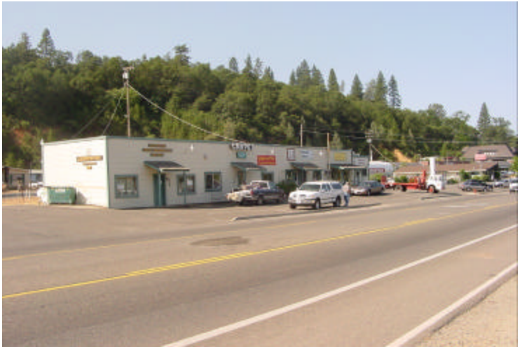
2 - Retail strip on Placerville Rd, adjacent to propane tanks