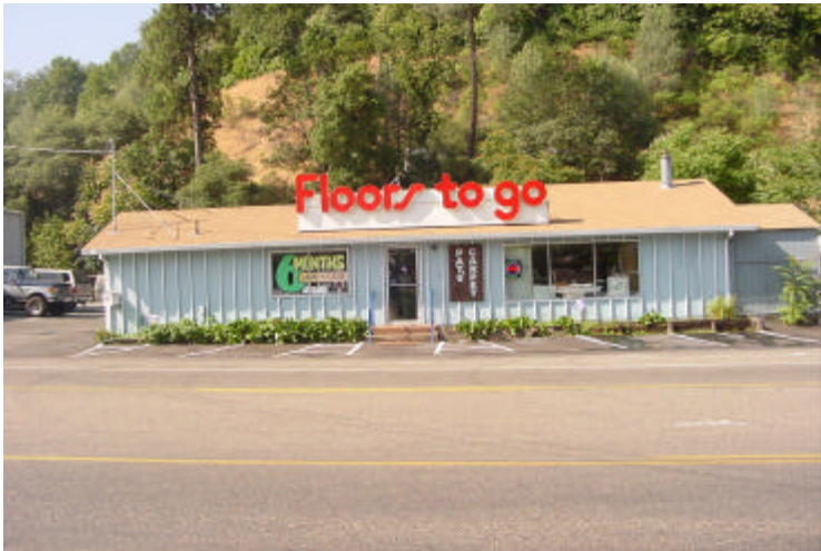
5 - Commercial building adjacent to other commercial & vacant lot