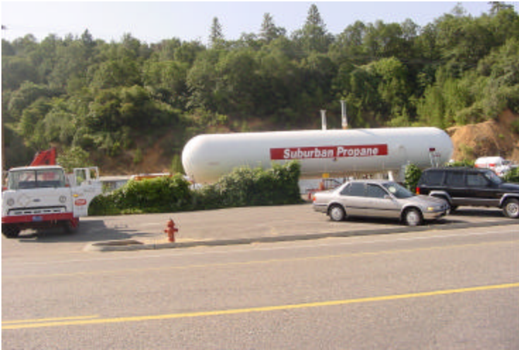
1 - Propane station, south of Placerville Rd, on Northwest corner of Study Area