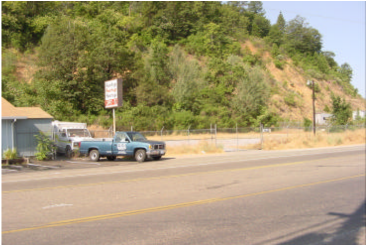
4 - Vacant lot adjacent to commercial building