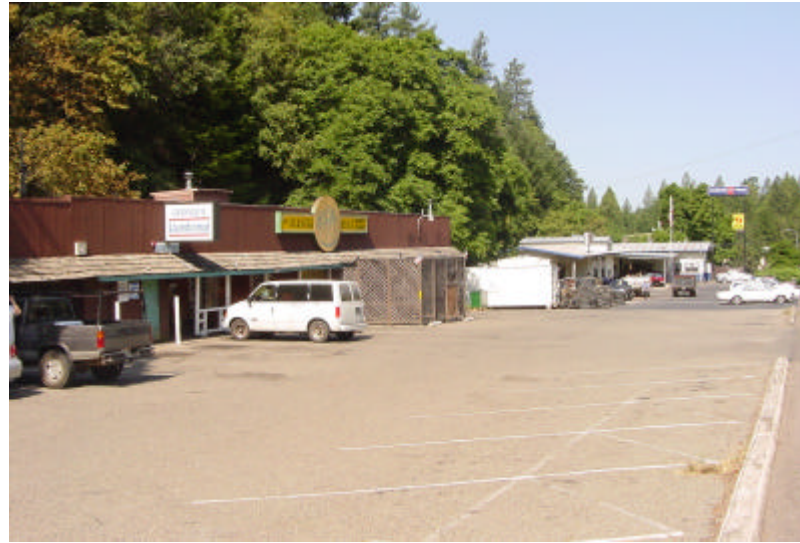
1 - Retail strip facing Broadway & US 50