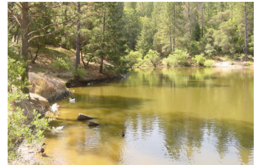
5 - Duck pond adjacent to park & single-family residence