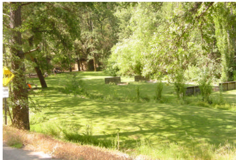
4 - Park adjacent to single-family residence