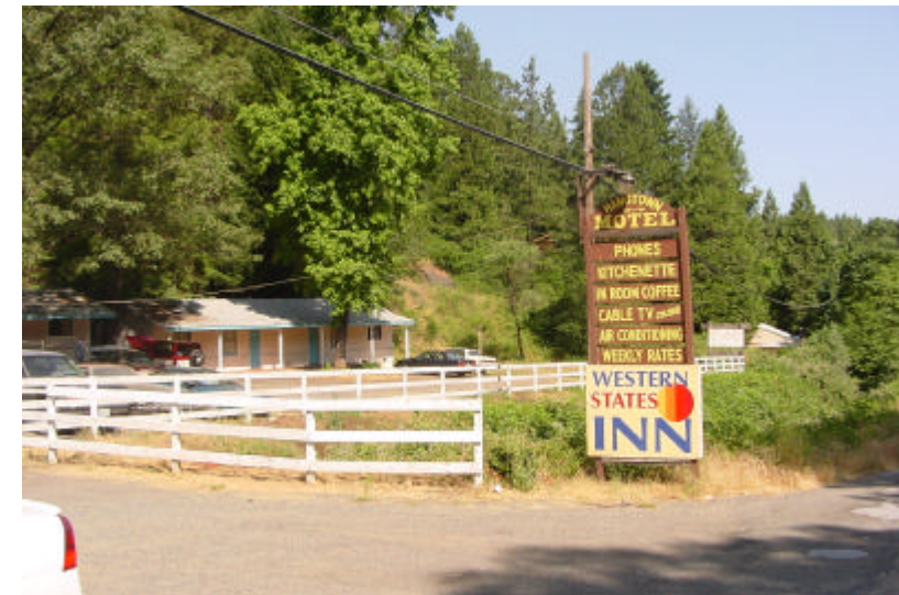
3 - Motel adjacent to vacant land, facing US 50 & Broadway