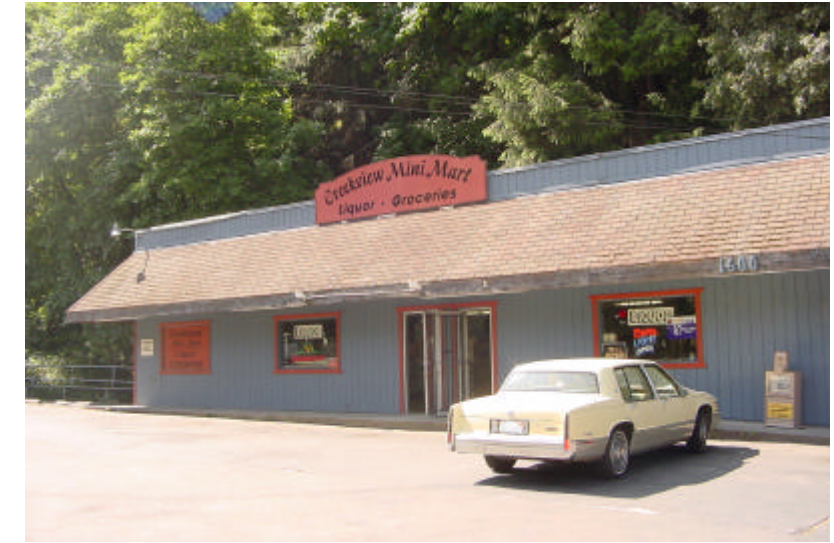
2 - Convenience store facing Broadway & US 50