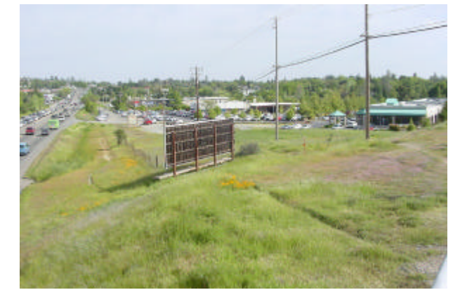
3 - Looking South along Hwy 49 from UPRR tracks