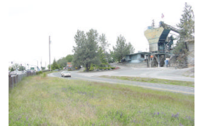
13 - Looking North on Hwy 49 at industrial yard