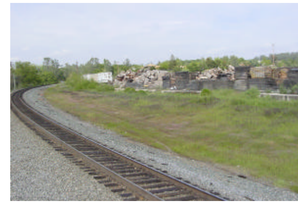
2 - Looking Southwest along UPRR tracks