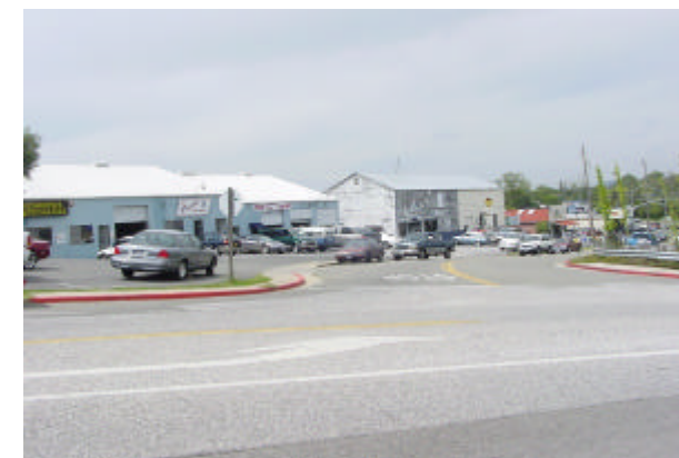
12 - Looking South on Nevada St, behind auto dealership