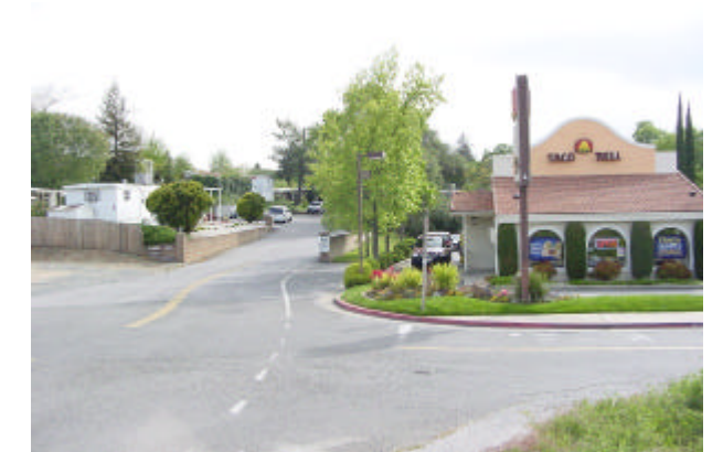
6 - Mobile home park and adjacent fast-food restaurant on Hwy 49 frontage road