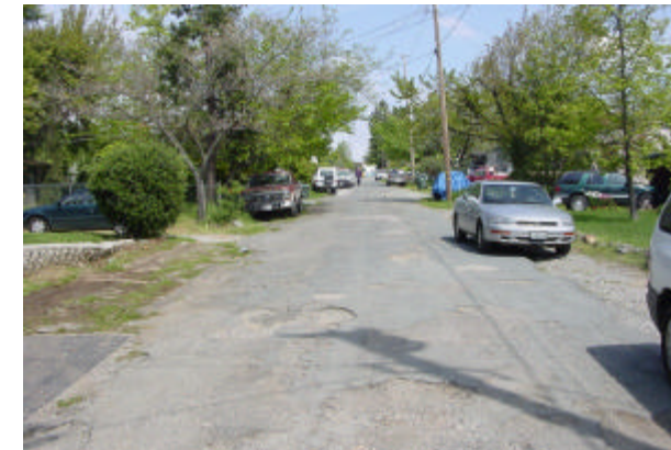
8 - Large lot single family homes, adjacent to open space & multi-family