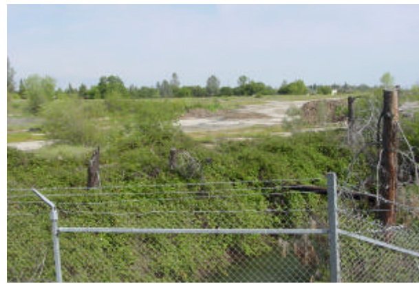
1 - Vacant land adjacent to canal & railroad, looking Southeast