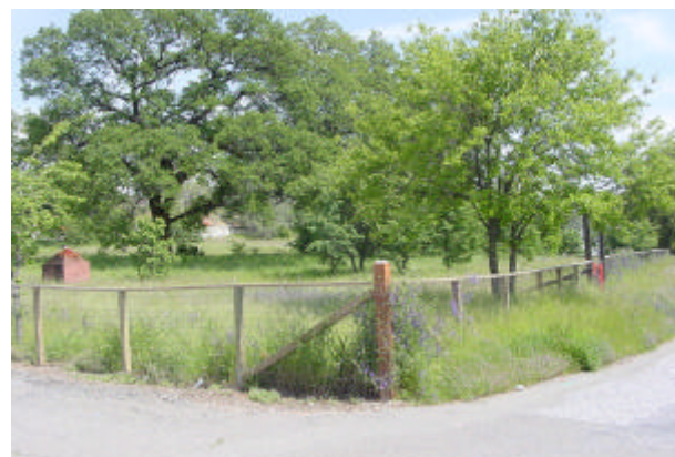
11 - Chinese Cemetery off Hwy 49