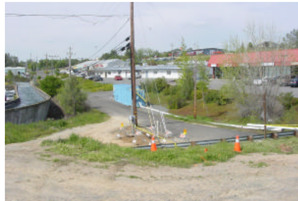
7 - Retail & light industrial, looking North on Canal from Hwy 49