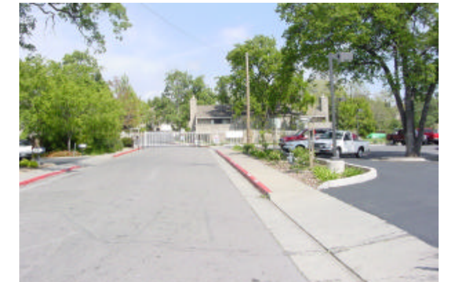
9 - Access road multi-family housing, between retail centers