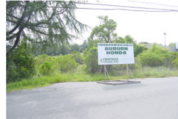
5 - Vacant land slated for auto sales, looking West from Hwy 49