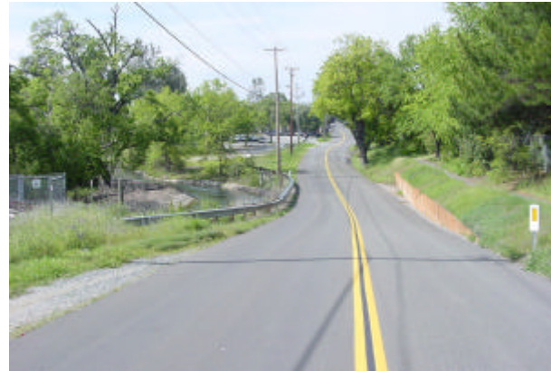
4 - Looking North along Canal St at irrigation canal & adjacent PG&E facility