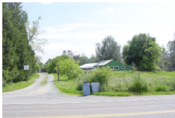
10 - Rural residential, looking South from Edgewood