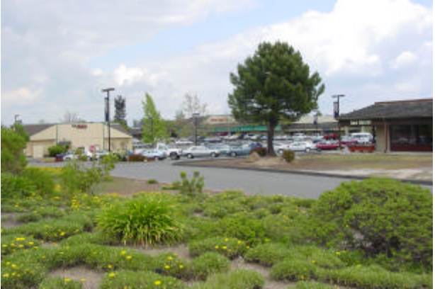
8 - Retail center on Northeast corner of Auburn-Folsom & Fuller