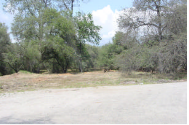
3 - Vacant land, looking North from Douglas