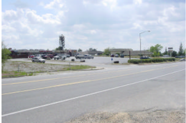
7 - Looking Southwest from Douglas, retail center bordered by vacant land East & West