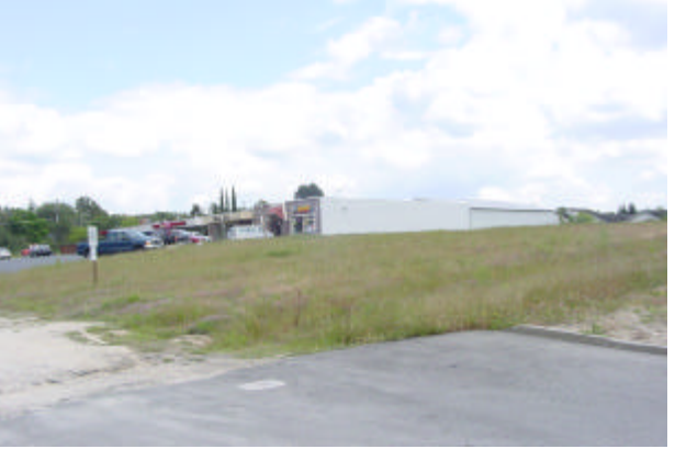
6 - Vacant land, looking Southeast from Douglas, bordered by retail East & West