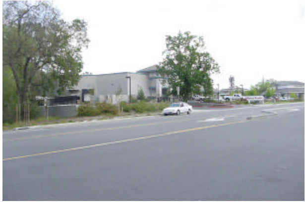
1 - Looking Southeast at retail center with open space adjacent to the North