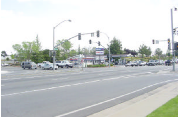
4 - Gas station & retail (behind) on Southeast corner of Douglas & Auburn-Folsom