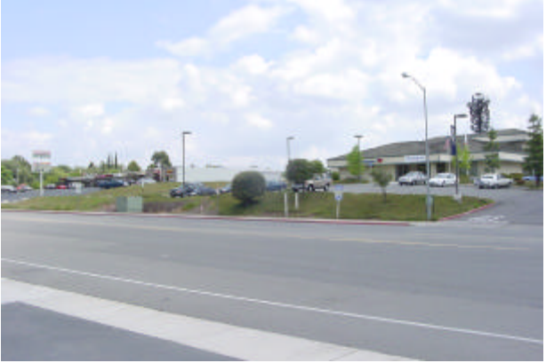
5 - retail center with adjacent vacant land, looking Southeast from Douglas