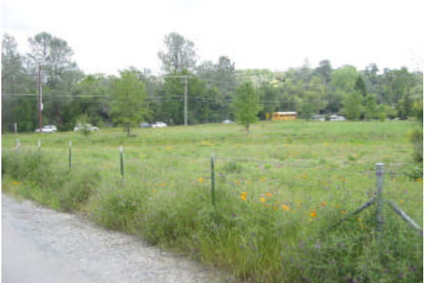
11 - Looking Southeast across vacant land on Southwest corner of Eureka & Auburn-Folsom