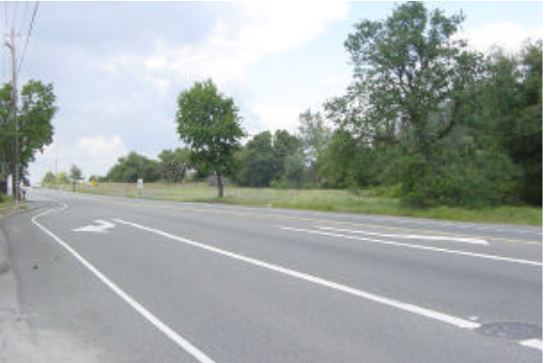
10 - Looking Northeast across Auburn-Folsom toward open space South of Fuller