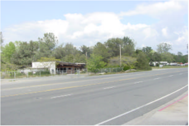
2 - Vacant commercial building, looking North North from Douglas