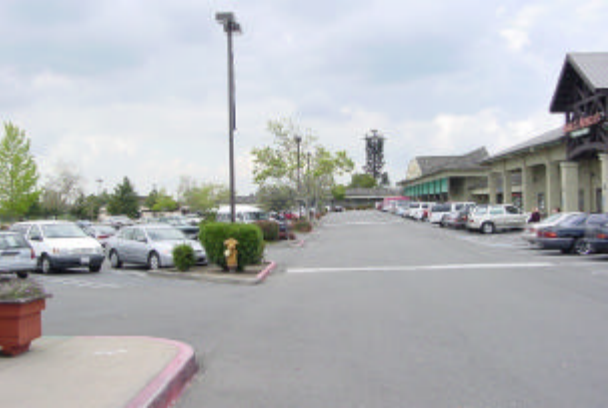
9 - Retail center, looking North from Fuller