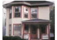
4 Small Lot Single Family Residential