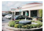
12 Community / Neighborhood Retail