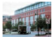
24 Public / Civic / Education