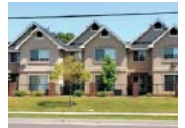
6 Low-Rise Condos