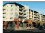
17 Mixed-Use Residential Focus High-Rise