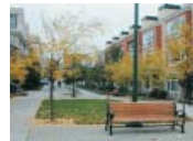
15 Live / Work