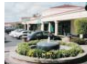
12 Community / Neighborhood Retail