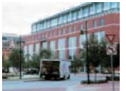
24 Public / Civic / Education