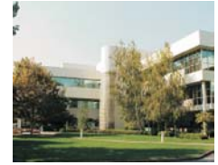
10 Mid-Rise Office