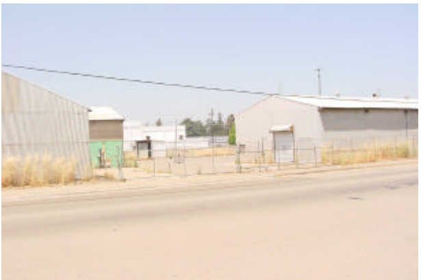
8 - Vacant lot