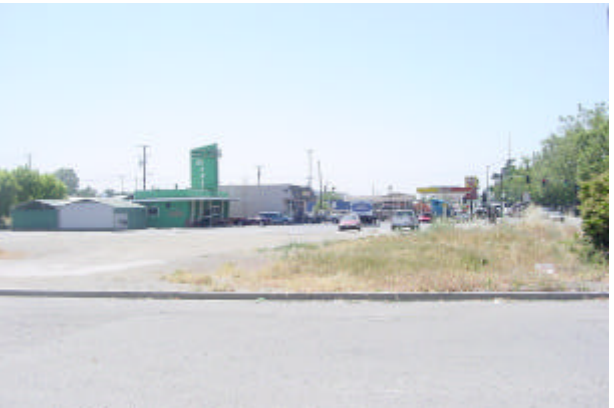
2 - Gas station & bar, with adjacent vacant lot