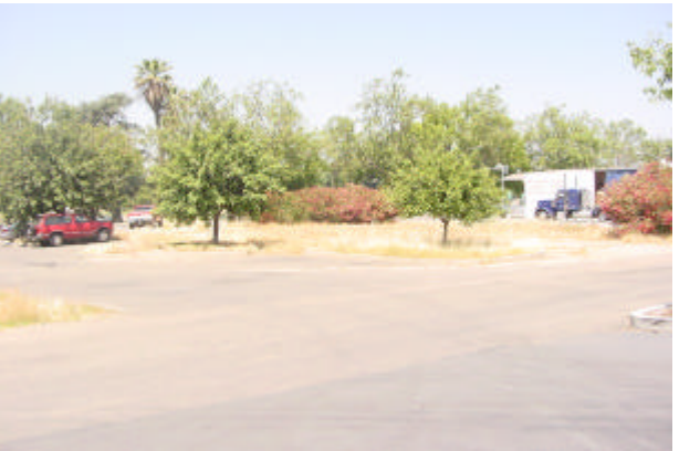
3 - Vacant / parking lot