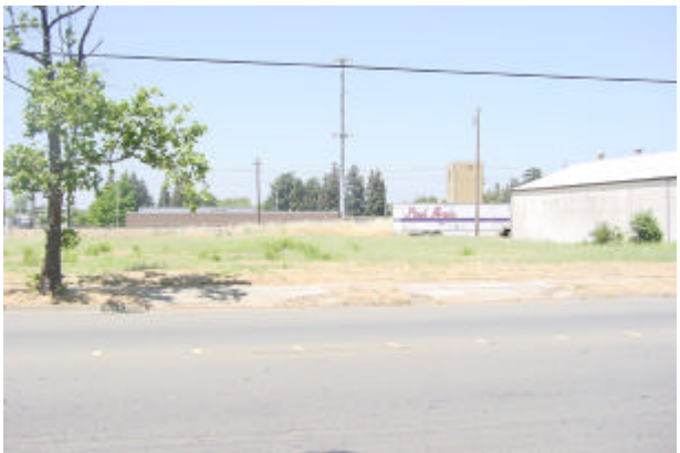
7 - Vacant lot along railroad