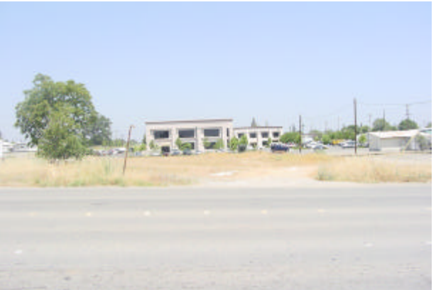
6 - Office complex and adjacent vacant lot