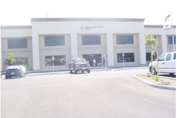
10 - New CalTrans offices at Yuba & 7th Streets