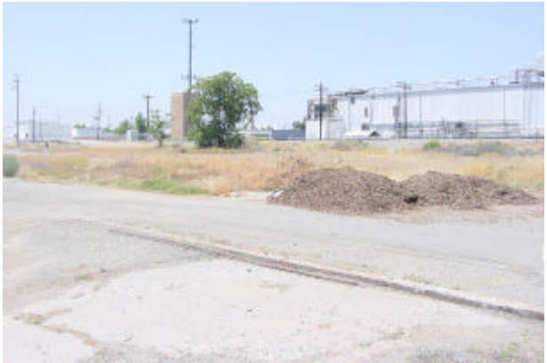
4 - Vacant lot along railroad