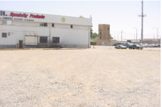
5 - Vacant lot beside light industrial (food processing)