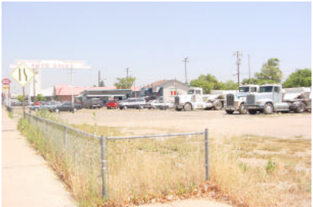
1 - Gas station & used car lot, with adjacent vacant land