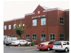
10 Mid-Rise Office