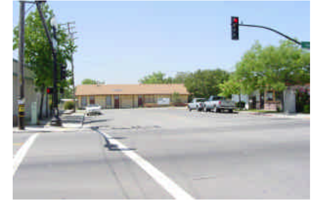
8 - Closed train depot adjacent to railroad lines