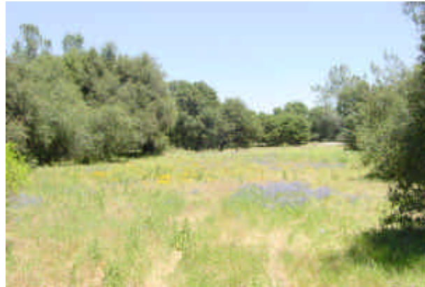
2 - Vacant field, looking East from Horseshoe Bar Road