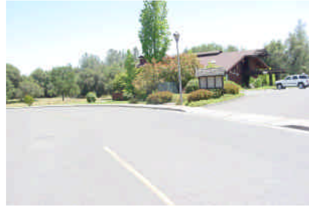
5 - Library adjacent to the Veterans Memorial Hall