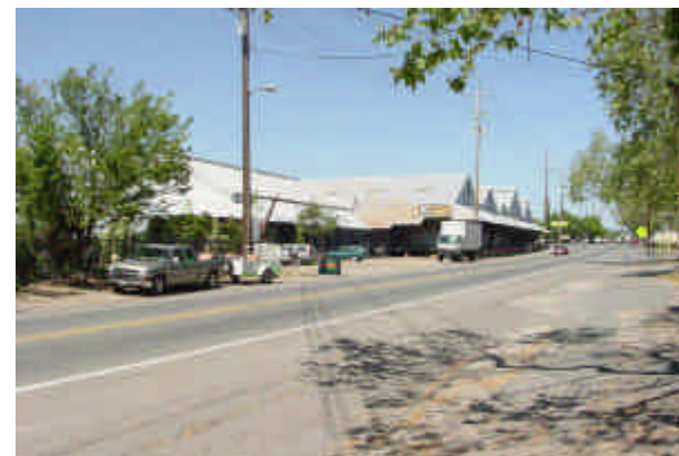
11 - Commercial strip along Taylor Road