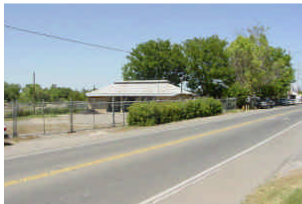
9 - Vacant land adjacent to lumber yard looking Northeast on Taylor Road