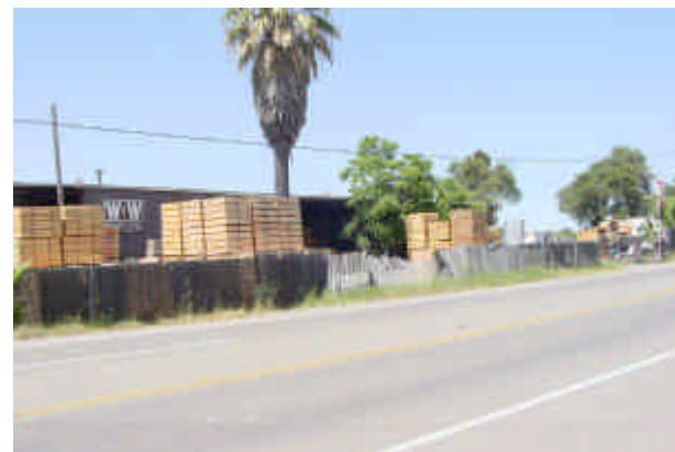
10 - Lumber yard on Taylor Road adjacent to railroad lines