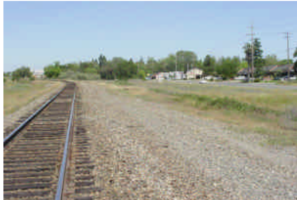
4 - Rail Line adjacent to Taylor Road