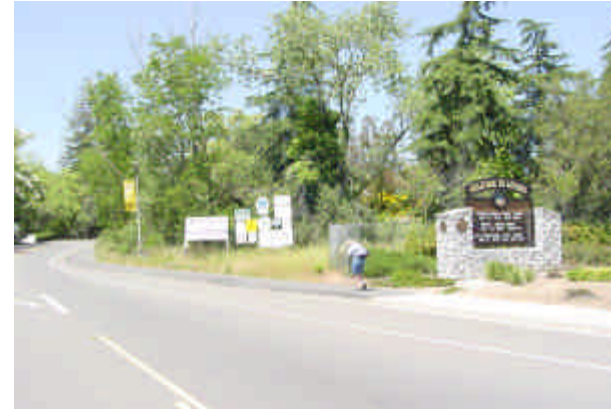
6 - Entering the town center from Horseshoe Bar Road