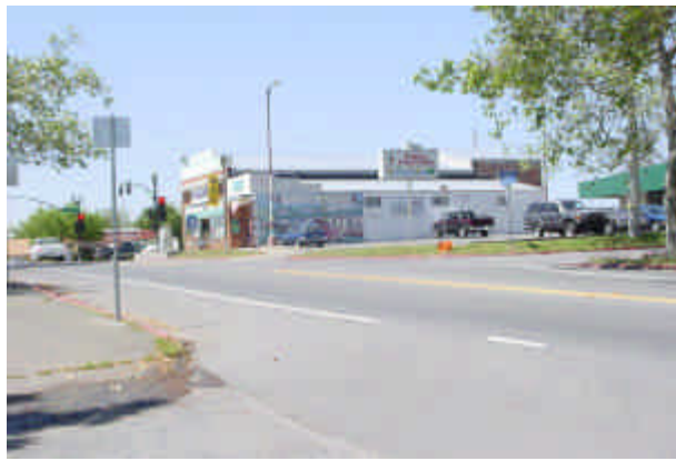
1 - Retail center at the corner of Laird and Horseshoe Bar