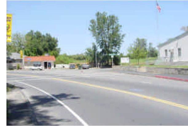
7 - Veterans Memorial Hall