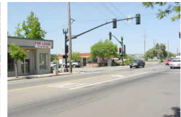
13 - Commercial uses at the corner of Taylor and Horseshoe Bar