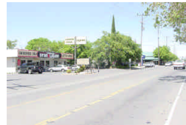
12 - Commercial strip on Taylor Road looking Northeast towards the town center