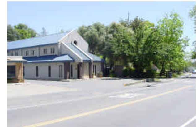
3 - Accounting office East of Horseshoe Bar Road