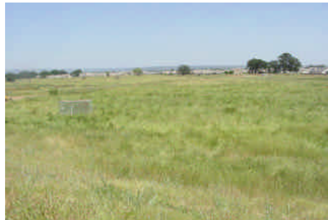
3 - Vacant land adjacent to waste water treatment facility