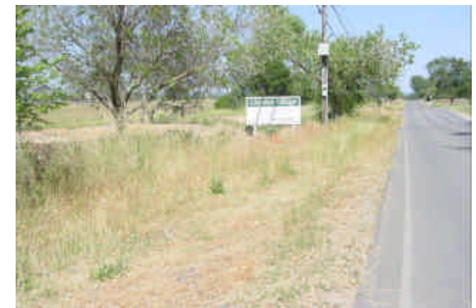
9 - Vacant lots advertised for development on Virginiatown Road