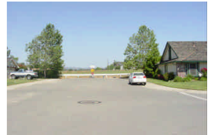
5 - Single Family Residential looking East from 10th Street