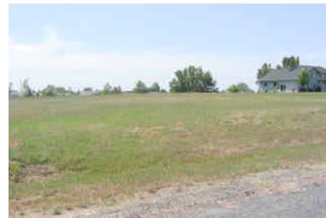
7 - Vacant lot adjacent to Single Family Residential homes