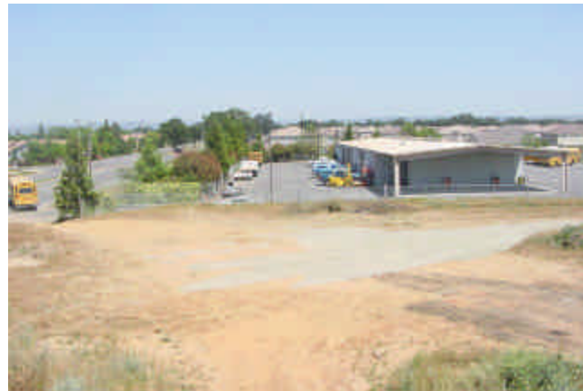
1 - School bus depot