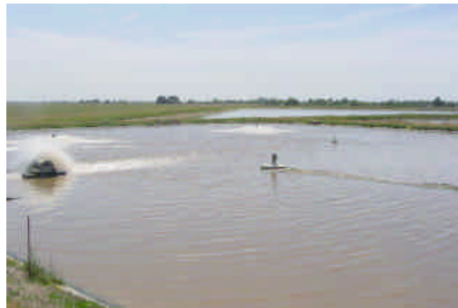
2 - Waste water treatment plant facility