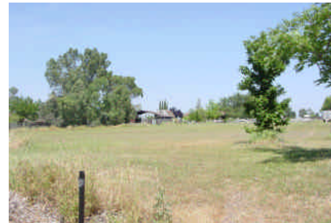
4 - Rural Residential looking East on 11th Avenue