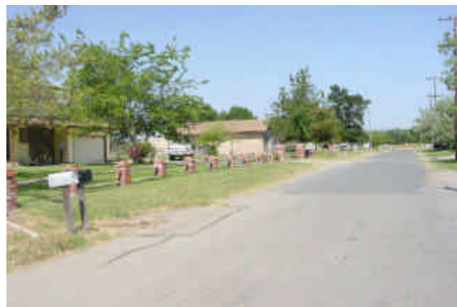
6 - Single Family and Rural Residential looking East on 9th Avenue