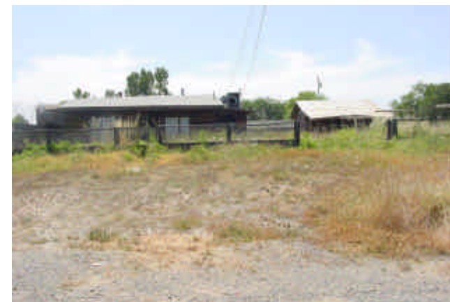
8 - Rural Residential lots looking North on Liberty Street