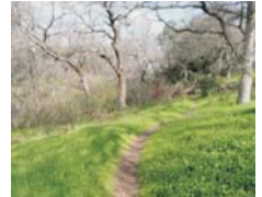
25 Open Space